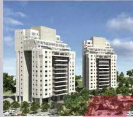
▶ GINDI GARDENS