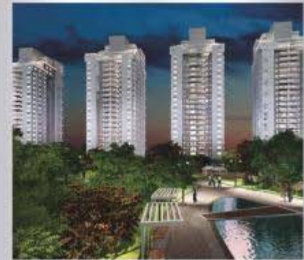
▶ ONE & ONLY