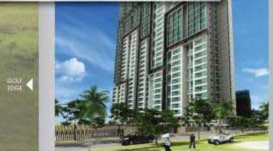
▶ GOLD EDGE

Phoenix Hodu Developers Pvt Ltd is a joint venture between Phoenix group Hyderabad and Hodu Holdings Israel. The combination brings local experience and international expertise, two formidable and reputed entities have come together, to give concrete shape to your dream home.