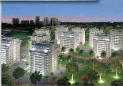
▶ GINDI BOULEVARD