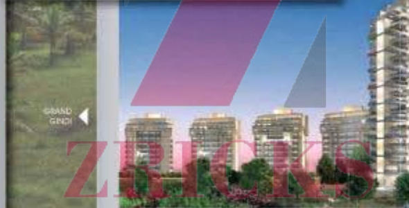
▶ GINDI GARDENS